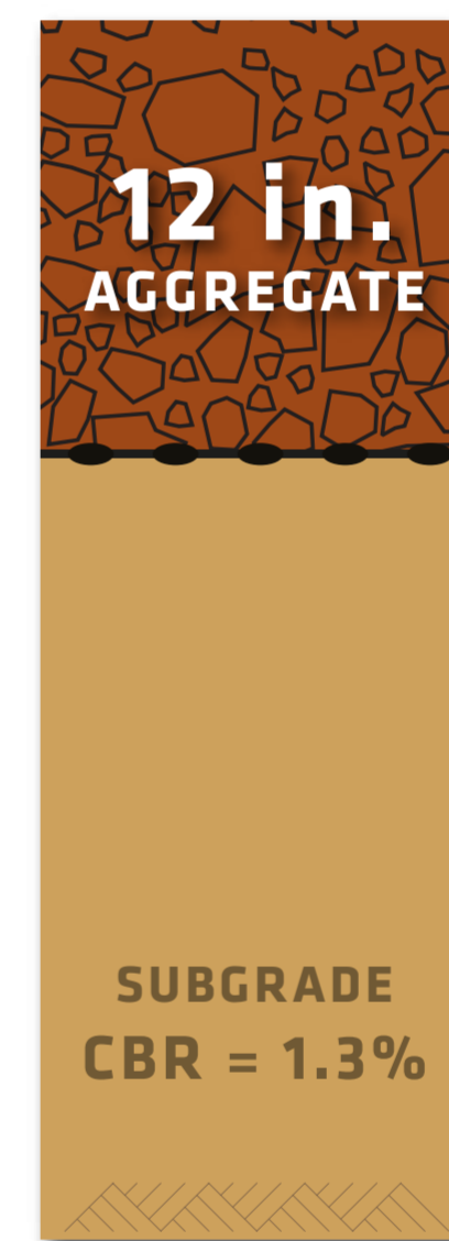
BX Geogrid (BX 1200)